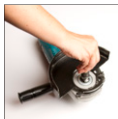
STEP 1. screw on the sleeve