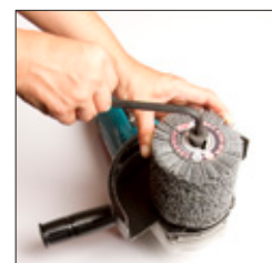
STEP 4. tighten nut with Allen wrench