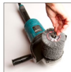
STEP 3. screw on the nut